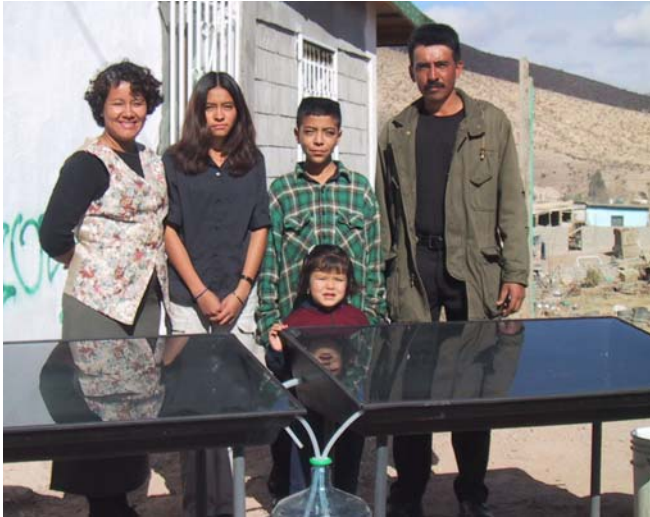
Fig. 4. Aguilar family using third generation SolAqua solar distillers operated in parallel with water rated membrane to meet their daily drinking water needs in the Anapra colonia of Chihuahua, Mexico immediately bordering New Mexico.

distillation. Occasionally, still users had to supplement their still supply with store-bought water, especially in the winter, when still production decreases to about half of summertime production. Yet the need for purchasing bottled water from a store was greatly mitigated in all cases. Solar still savings were approximately $150 - $200 a year per household instead of purchasing bottled water.