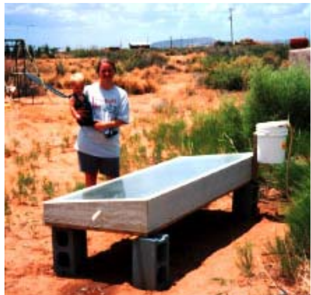
Fig. 2. First generation concrete sided EPSEA solar still built in 1995 that has been operational for over a decade for the

Solar still technology has gradually improved over the past decade along the Border. The greatest problem for the first generation stills designed by EPSEA in the mid-1990's (an improvement on the original McCracken solar still) was that when they dried out, the inner membrane silicone lining would outgas. This in turn deposited a fine film on the underside of the glass, causing the water droplets to bead up and fall back into the basin rather than trickle down the glass to the collection trough and thus still water production drops dramatically (about 80% or more drop). The first still used a food grade silicone and were made out of plywood and concrete siding. It was found that the stills (3' x 8') were often producing far more water than the users needed, especially in the summer. As time evolved, a second generation solar still was developed made out of aluminum and smaller (3' x 6' and 3' x 3'). The still was lighter, but expensive to build.